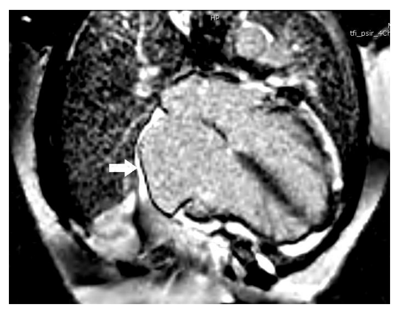
Figure 2. Extensively calcific pericardium causing constrictive pericarditis

are well-known long-term complications. Tuberculosis remains the major cause of Constrictive Pericarditis (CP) in South Asia and the Far East, making it the most common cause of CP in these countries.<sup>6</sup>