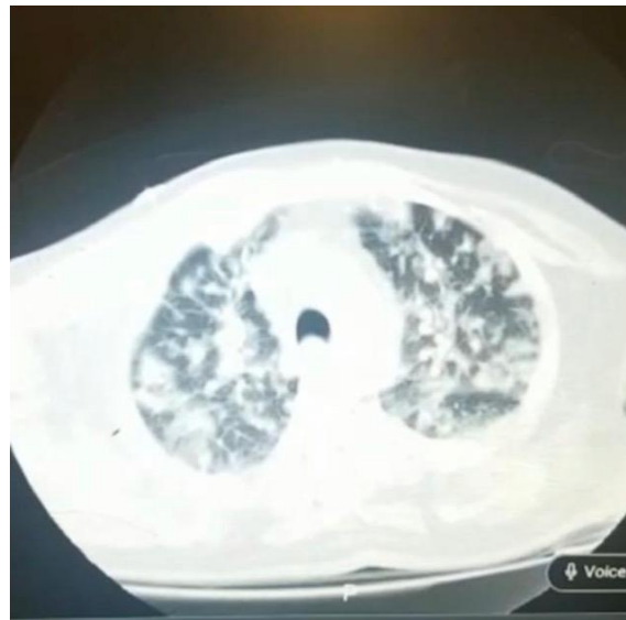
Figure 2. A chest CT scan of the patient reveals patchy bilateral infiltrations in favor of COVID-19 pneumonia

In addition, echocardiography was performed to identify the potential underlying cardiac involvement as the cause of his complete heart block. However, it was unremarkable, with preserved left ventricular ejection fraction, moderate chronic mitral regurgitation, and normal size and function of the right ventricle without effusion. Despite initial supportive therapies and functional TPM, his oxygen saturation and blood pressure gradually decreased after 10 hours of admission, necessitating endotracheal intubation and vasopressor infusion. Unfortunately, the patient died several hours later due to severe respiratory failure.