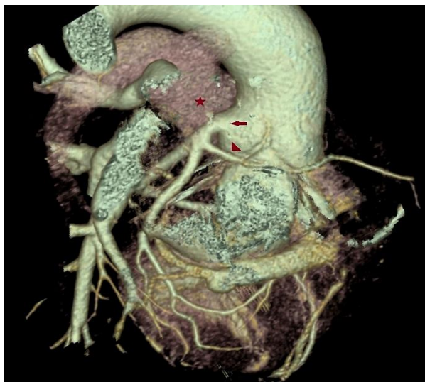
Figure 4. Multidetector computed tomography (MDCT) with volume rendered reconstruction (VR) showing trifurcation of left main artery into coronary angiography showing trifurcation of left main artery into left anterior descending (LAD), left circumflex (LCX), and right coronary artery (RCA) (red arrow: RCA; asterisk: Pulmonary trunk)

On holter monitoring, she had multiple runs of non-sustained ventricular tachycardia (NSVT). Based on family history, clinical presentation, and findings of ambulatory ECG, implantable cardioverter-defibrillator (ICD) (Boston Scientific, USA) was implanted. As she refused surgical myectomy, she was discharged in stable condition on metoprolol 100 mg twice daily with strict advice for restriction of strenuous physical activity. She was doing fine on follow-up.