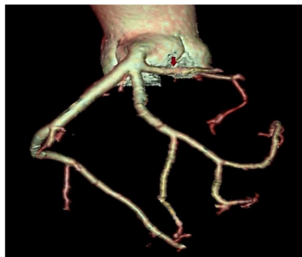
Figure 3. Multidetector computed tomography (MDCT) coronary angiography showing trifurcation of left main artery into left anterior descending (LAD), left circumflex (LCX), and right coronary artery (RCA) (red arrow: RCA)