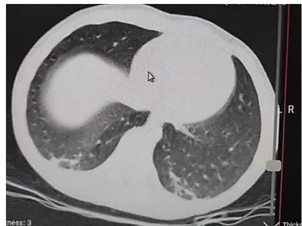
Figure 3. Spiral computed tomography (CT) scan of lungs (notice the lower parts slice)

control of distal end of the femoral vein, and in coordination with the anesthesia team, we milked the limb from distal to proximal with pressure band and evacuated about 300 cc blood and a few clots. At the end of operation, the inguinal canal floor was repaired. The patient was stable and extubated with good respiratory function and was transferred to the intensive care unit (ICU). The limb was in compression bandage and elevated. Heparin infusion (18 IU/Kg) was prescribed with control of partial thromboplastin time (PTT) (therapeutic range 60-80). In the first 12 hours of the post-operation time, she had normal urine output with normal blood pressure and heart rate. However, the blood oxygen saturation gradually decreased to 92% without any respiratory distress, which with nasal oxygenation, the saturation increased up to 97%. The body temperature was 36.8 degrees Celsius. Our first differential diagnosis was pulmonary emboli, so we performed echocardiography. The function of the right heart chamber was normal. To rule out other respiratory pathologies such as the coronavirus disease-2019 (COVID-19) pneumonia, we performed chest spiral computed tomography (CT) scan and found non-specific lesions in lower part of right lung (Figure 3).