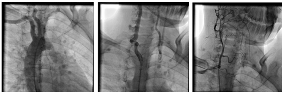
Figure 3. The catheterization findings of the patient; (A, left image), (B, middle image), and (C, right image)