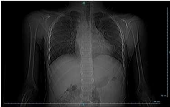
Figure 1. The patient's chest X-ray

In CT angiogram, the left carotid artery was significantly narrower than the right one which seemed to be dilated for enough cerebral circulation. Moreover, as a rare anomalous finding, the left subclavian artery aroused from this narrow carotid artery and the left vertebral artery originated from this subclavian artery (Figures 2.A and 2.B).