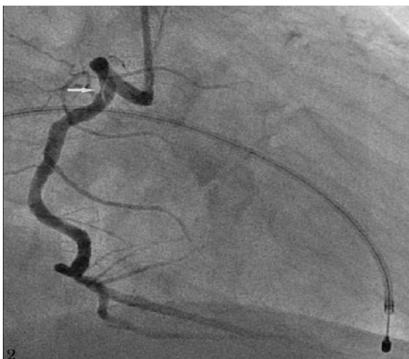
Figure 2. Right anterior oblique projection showing clear angiographic flap (arrow) in the right coronary artery