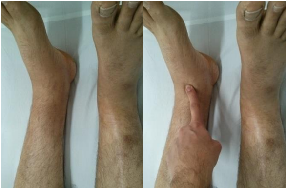
Figure 1. 2 + grade of lower limbs edema

In electrocardiogram, there was no sign of abnormal conductive pathways. Cardiac rhythm was sinus tachycardia (Figure 3).