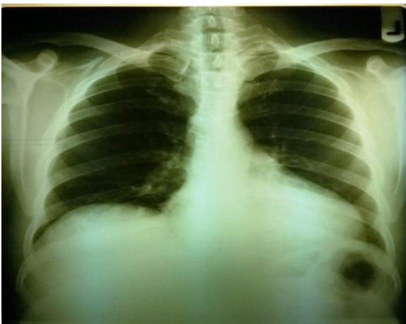
Figure 2. Antro-posterior chest X-ray

In electrocardiogram, there was no sign of abnormal conductive pathways. Cardiac rhythm was sinus tachycardia (Figure 3).