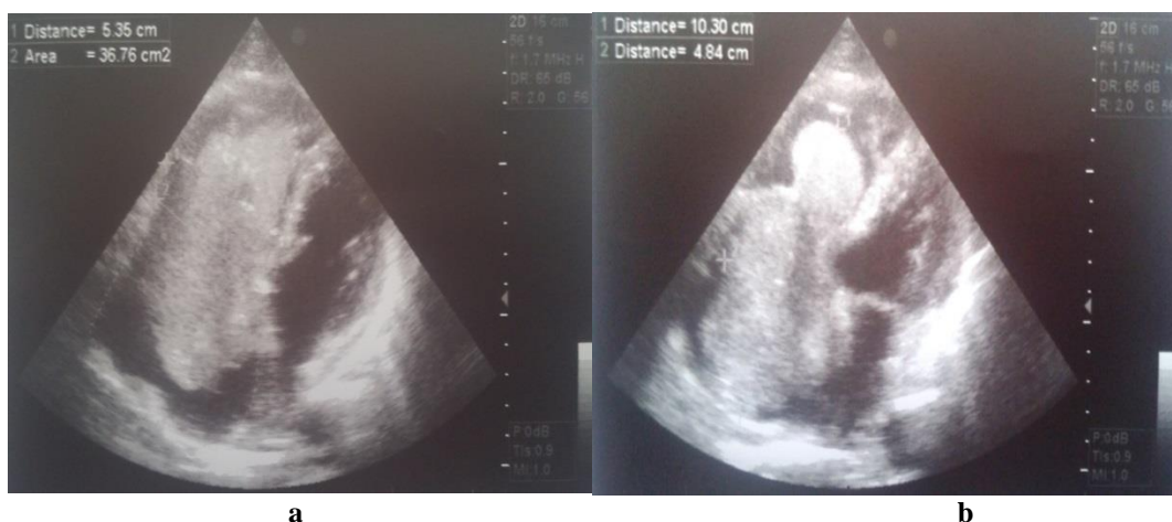
Figure 4. (a and b) Apical four chambers view (an echocardiography before cardiac surgery), showing hypermobile huge mass in right side of the heart

During cardiac surgery and after tumor removal, saline test was performed by cardiac surgeon. According to this test, the surgeon concluded that inappropriate function of TV was due to mass.