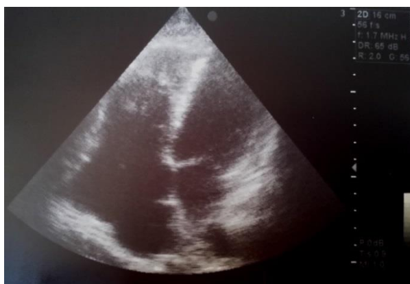
Figure 6. Transthoracic echocardiography four chambers view, shows mal coaptation, with severe free low-pressure tricuspid regurgitation

Echocardiography of patient, as shown in figure 6, indicated that RV and RA, were severely dilated RV systolic function was severely impaired. TV, had leaflet malcoaptation (2 cm), with severe free low-pressure regurgitation [tricuspid regurgitation (TR)], and mild pulmonary insufficiency.