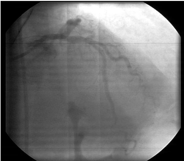
Figure 4. After graft stent deployment

immediately at the overlapping segment of the stents and it sealed the perforation (Figure 4).