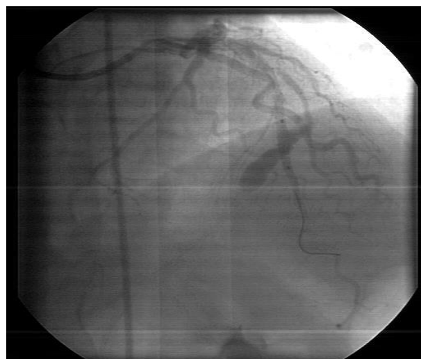
Figure 3. Rupture of left anterior descending to ventricular septum

It resembled an enlarging sac which suddenly ruptured (Figure 3).