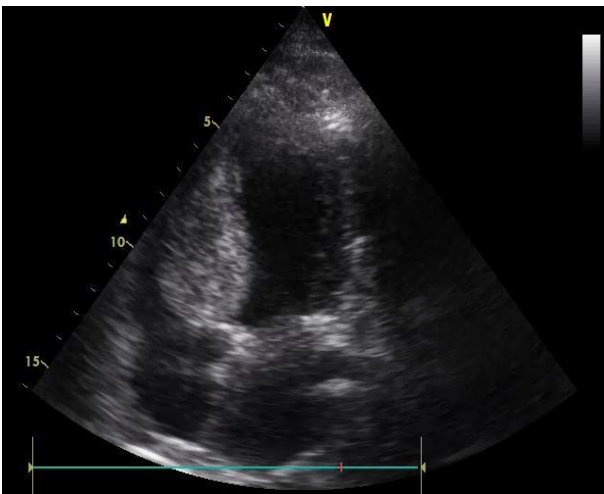
Figure 5. Ventricular septal hematoma

In this stage, the heparin effect was reversed by prothamin sulfate. The echocardiography at the same time showed a voluminous (about 30 mm) ventricular IVSH (Figure 5).