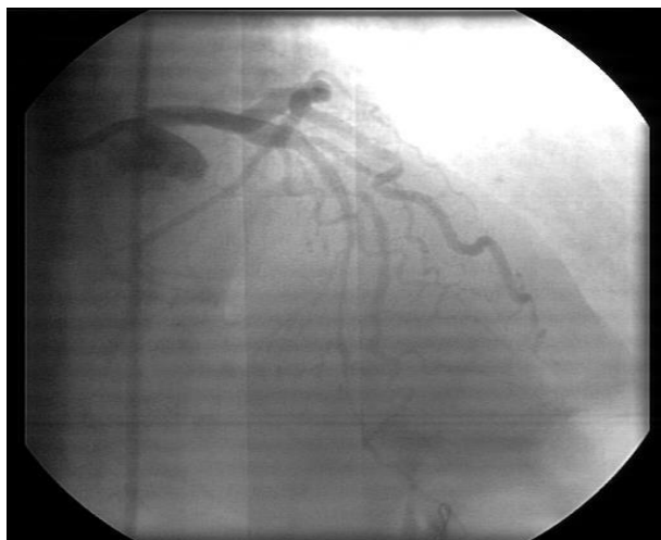
Figure 1. Wire dissection at the distal segment of left anterior descending

For treatment of in-stent restenosis of the LAD artery and the diagonal branch stenosis, we advanced a hydrophilic wire into the LAD and another tapered-tip wire through the struts of the LAD stent into the diagonal branch. Final kissing balloon inflation was performed by using two non-compliant (NC) balloons (3 × 15 mm DEB and 2.5 × 12 mm NC-balloons in the LAD and diagonal arteries). Unexpectedly, a diffused dissection without a distal runoff (type F) appeared in the mid to distal portions of the LAD due to the wire to-and-fro movement. Primarily and according to the available stents, the distal portion of the dissected segment was covered by using a 2.75 × 26 DES (Figure 1).