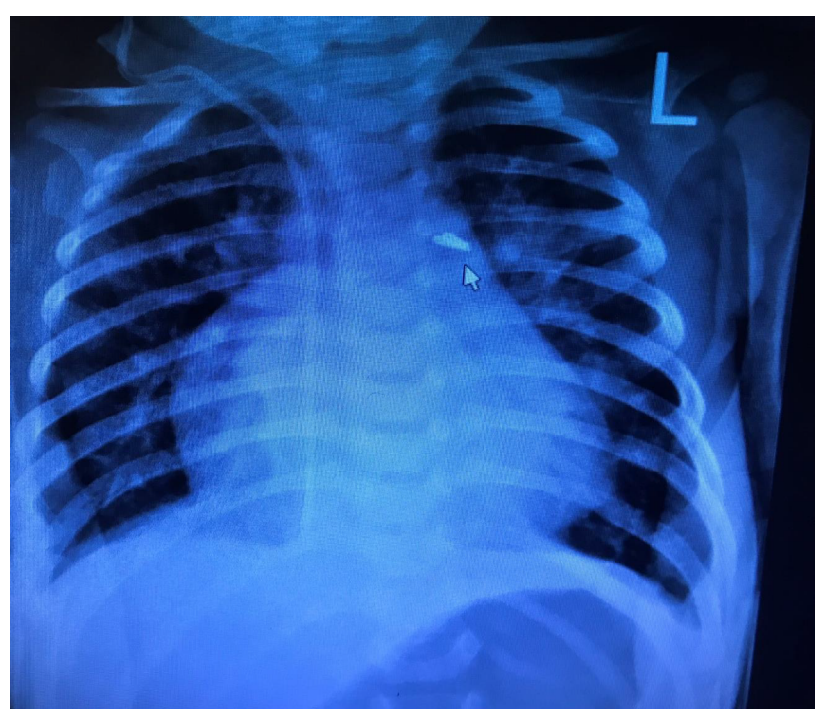
Figure 1. The CXR of the patient before the second surgery; the location of the PAb and metal clips is marked with an arrow

After the operation, in the postoperative period, the only noticeable incident was a low-grade fever that lasted for a few days and was relieved with generic antibiotics after the surgery, and the child was discharged on the tenth day post-surgery. There were no problems in the follow-up examinations either.