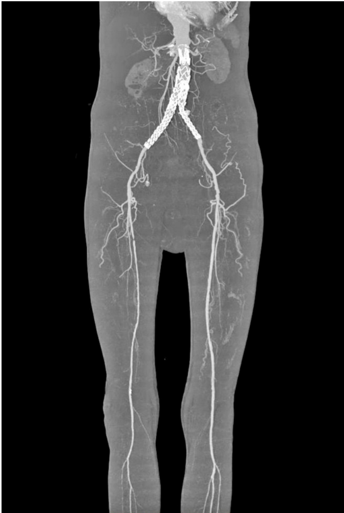
Figure 3-4. Postoperative reconstructed 3-dimensional computed tomography arteriography (CTA) scans obtained 3 months after repair shows that the left iliac artery is patent.