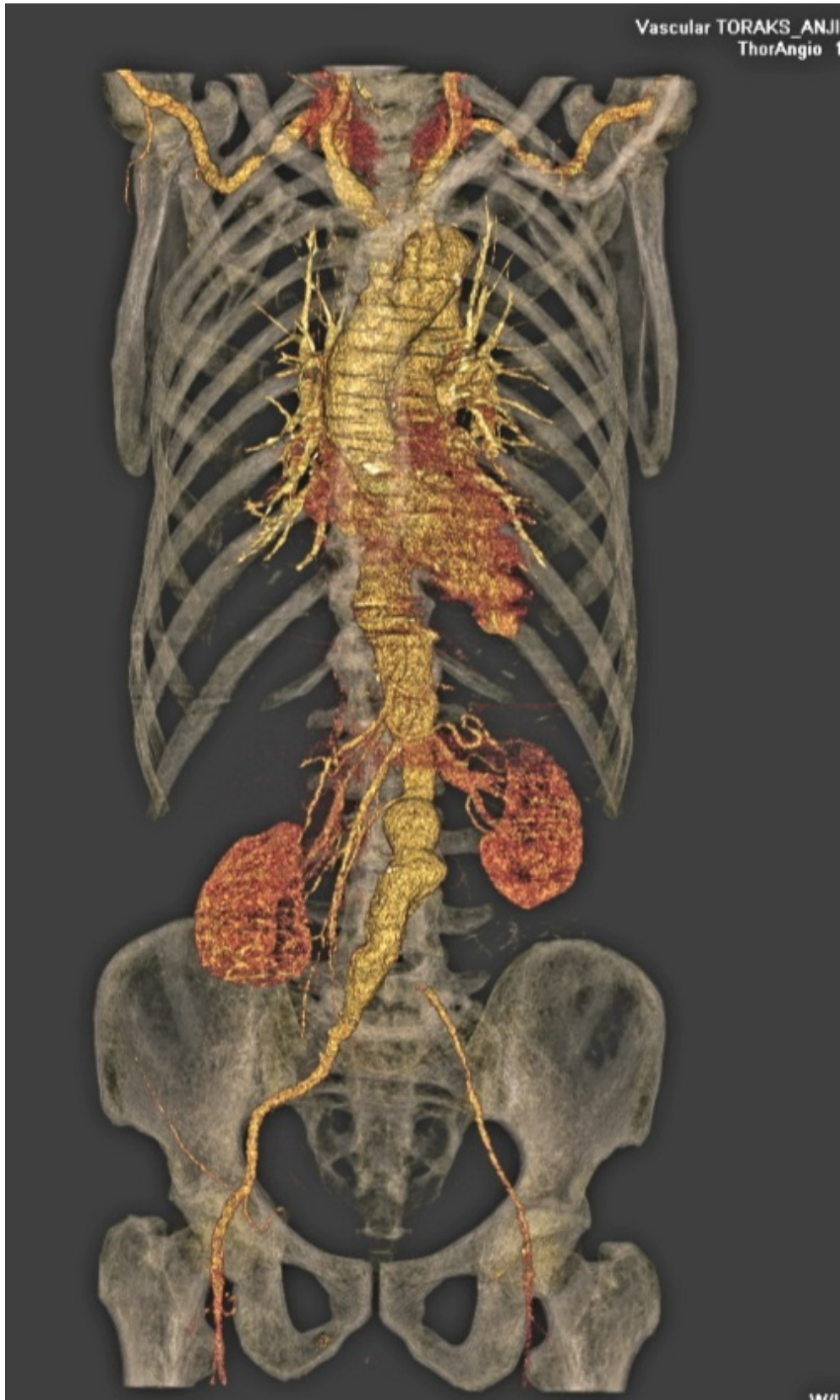
Figure 2. Preoperative reconstructed 3-dimensional computed tomography arteriography (CTA) scan showing an infrarenal abdominal aortic aneurysm (AAA) with concomitant occlusive disease from the left common iliac artery to the left external iliac artery.