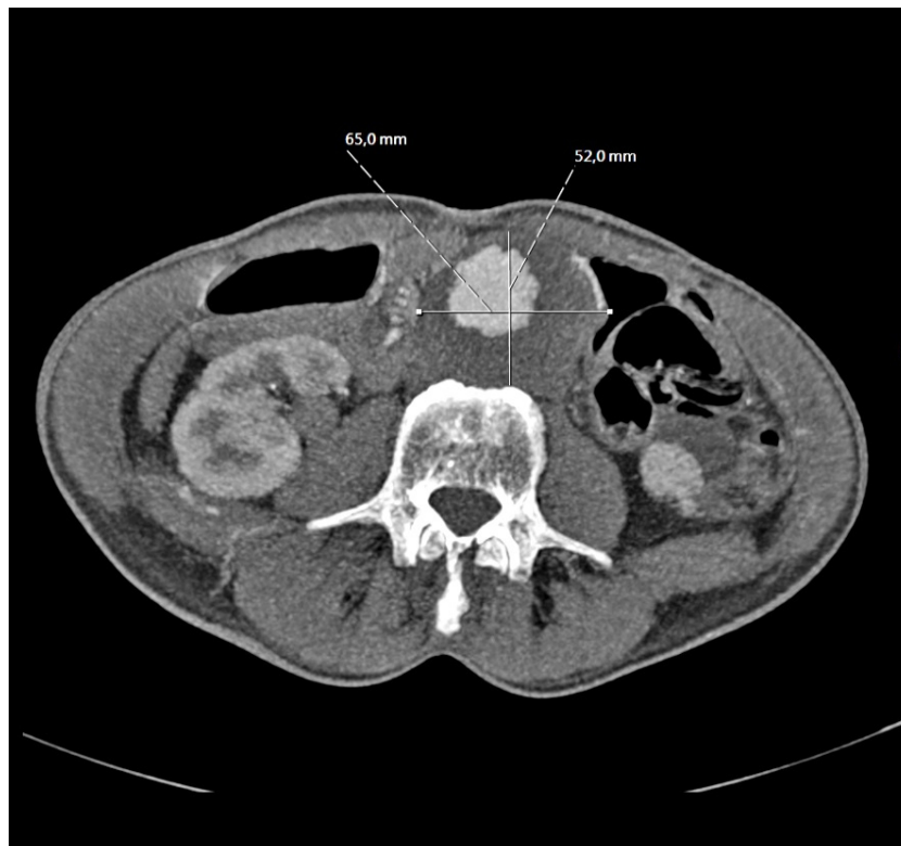
Figure 1. Preoperative computed tomography arteriography (CTA) scan showing 65mm diametered infrarenal AAA

The patient, who EVAR was planned to be performed in combination with left iliac artery revascularization in the same session, was processed in the angiography unit, and after exploring the right