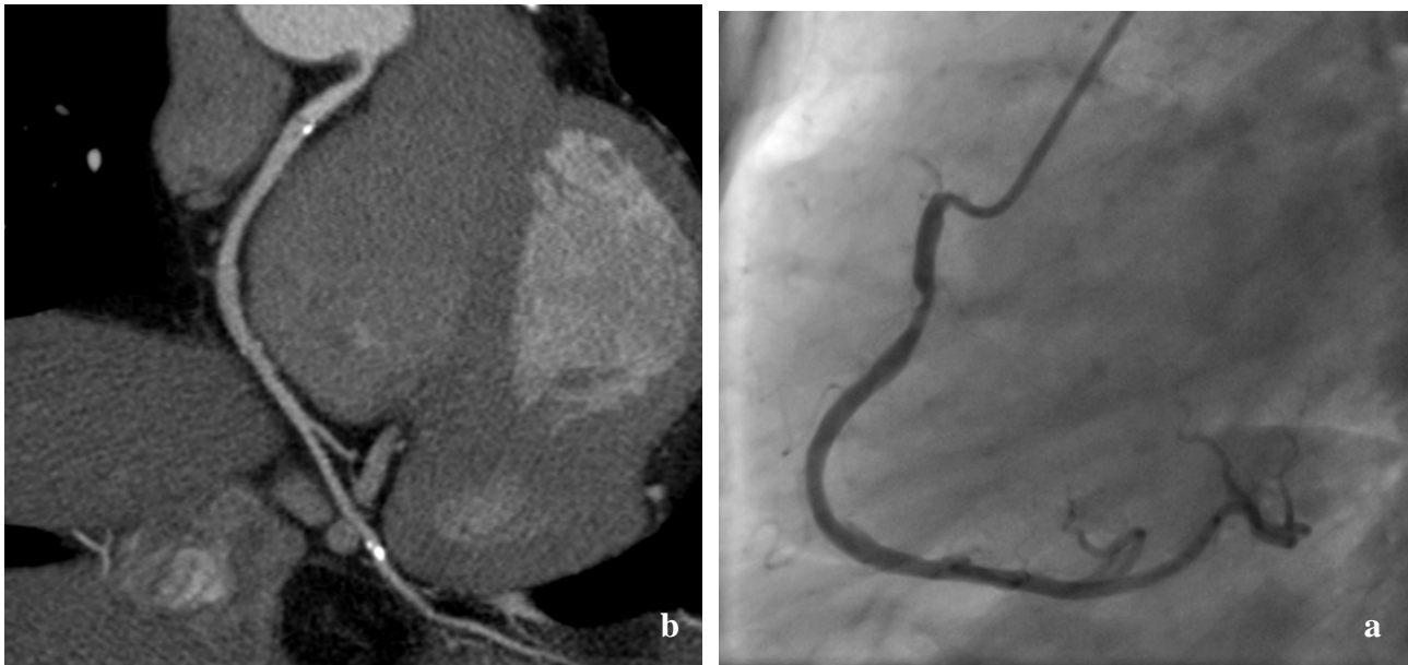
Figure 1. A typical example of false negative cases where (a) computed tomography angiography (CTA) reveals no significant stenosis while (b) conventional invasive angiography (CIA) shows a significant stenosis at proximal part of right coronary artery

TP: True positive; TN: True negative; FP: False positive; FN: False negative; PPV: positive predictive value; NPV: negative predictive value