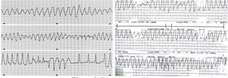
Figure 2. Torsades de pointes