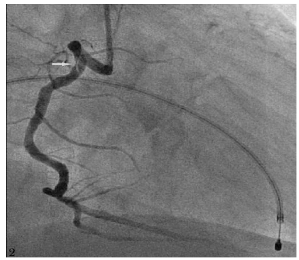
Figure 2. Right anterior oblique projection showing clear angiographic flap (arrow) in the right coronary artery