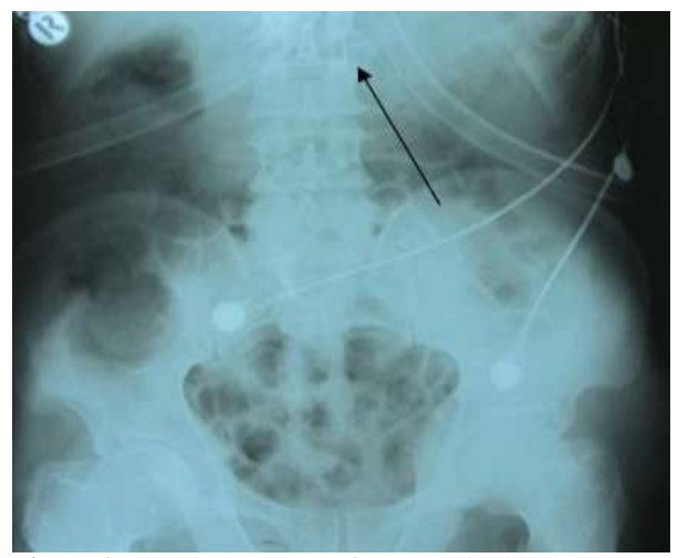
Figure 1. The displacement of catheter tip (black arrow)

reveal the condition of portal and liver venous and arterial flow blood flow, but showed the reduction of renal arterial blood flow. However, in a thoracic X-ray catheter's tip was not detected, and an abdominal X-Ray showed that the balloon pump catheter's tip was displaced distally; uncovering of catheter dressing in right thigh revealed loosing of fixation suture of catheter to the skin in its correct position (Figure 1).