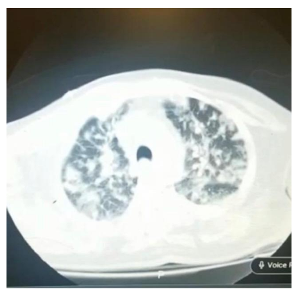
Figure 2. A chest CT scan of the patient reveals patchy bilateral infiltrations in favor of COVID-19 pneumonia

In addition, echocardiography was performed to identify the potential underlying cardiac involvement as the cause of his complete heart block. However, it was unremarkable, with preserved left ventricular ejection fraction, moderate chronic mitral regurgitation, and normal size and function of the right ventricle without effusion. Despite initial supportive therapies and functional TPM, his oxygen saturation and blood pressure gradually decreased after 10 hours of admission, necessitating endotracheal intubation and vasopressor infusion. Unfortunately, the patient died several hours later due to severe respiratory failure.