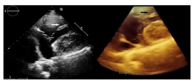
Figure 1. Transthoracic two-dimensional (left image) and three-dimensional (right image) echocardiograms in case 1, in mid-systolic time and right ventricle inflow view showing the attachment of the anterior and the septal leaflets of the tricuspid valve to a single papillary muscle (arrows)

Transthoracic echocardiography revealed large (26 mm) secundum type atrial septal defect with left to right shunt and all the tricuspid valve leaflets appeared to be connected to a single calcified papillary muscle in right ventricle suggestive of parachute tricuspid valve (Figure 1). Other findings were severe right ventricle and right atrial enlargement and moderate to severe tricuspid regurgitation without significant tricuspid stenosis. Measured systolic pulmonary pressure gradient was 47 mmHg.