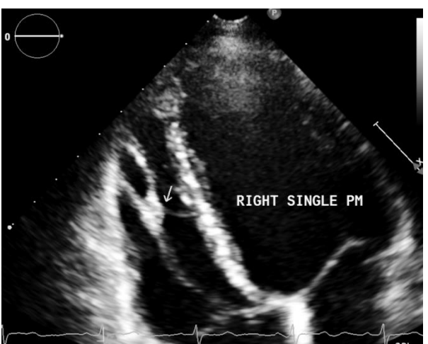
Figure 3. Transthoracic echocardiogram in case 2, in mid-systolic time and four chamber view of the right heart showing the unusual fusion of right ventricle papillary muscles (PM) resulting in a single calcified head for attachment of all tricuspid leaflets (white arrow)

Transthoracic echocardiography revealed a right ventricle with unusual fusion of papillary muscles resulting a single calcified head for attachment of all tricuspid valve leaflets. These findings were suggestive of a parachute-like tricuspid valve. Other data were mild to moderate tricuspid regurgitation without any stenosis, normal right ventricle size and function without any associated anomaly (Figure 3). Parachute-like tricuspid valve was confirmed by three dimensional echocardiography (Figure 4).