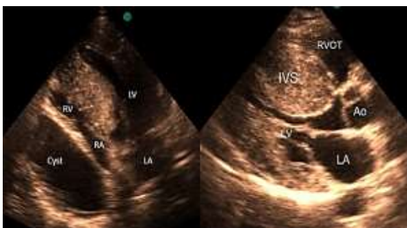
Figure 1. Transthoracic echocardiography view demonstrates the presence of hypertrophic obstructive cardiomyopathy

Chest X-ray showed large cystic lesion in right lung space. Transthoracic echocardiography showed normal left ventricular size and mild systolic dysfunction, severe left ventricular hypertrophy with significant asymmetric septal hypertrophy, severe systolic anterior motion resulting in significant left ventricular outflow tract (LVOT) obstruction consistent with HOCM (maximal late peaking gradient at rest = 64 mmHg), and relatively small right ventricular size due to compression effect of a large echo-free space at the right side of heart suggestive of pericardial cyst, which had compressive effect on right atrium, too (Figure 1).