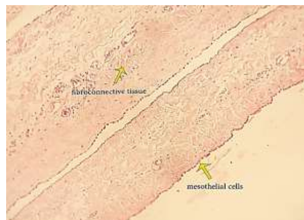
Figure 3. Fibroconnective tissue lined by a layer of mesothelial cells in microscopic evaluation

He underwent transaortic surgical septal myectomy via a standard median sternotomy, and by surgical exploration, a large cyst was found attached to the pericardium, anterior of right phrenic nerve, with 5 cm distance from diaphragm, and was extended totally into right pleural space. The cyst was excised and macroscopic examination showed the cystic pieces (12 × 12 × 3 cm) with smooth interior wall and wall thickness of about 1 mm, consistent with mesothelial cyst. Microscopic evaluation [hematoxylin and eosin (H&E) ×100] identified thin-walled cyst lined by single cell lining of non-pleomorphic cells with abundant eosinophilic cytoplasm, vesicular nuclei, and small nucleoli (Figure 3).